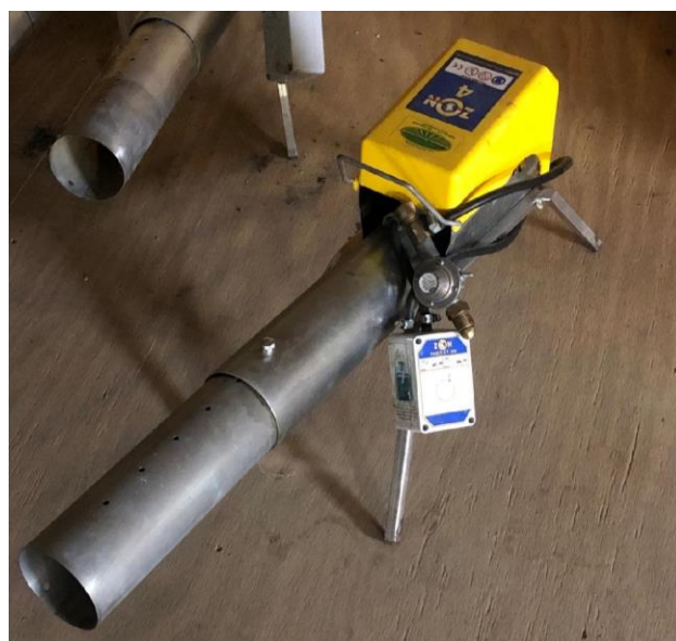
Propane scare cannons have long, cylindrical metal barrels and are elevated into the vineyard canopy on tripods or posts.

Similar to bird distress calls, propane scare cannons can be placed in the vineyard as an audio deterrent for birds. They shoot off a loud “shotgun” sound every few minutes throughout the course of the day. They are often used in combination with distress calls and visual deterrents.