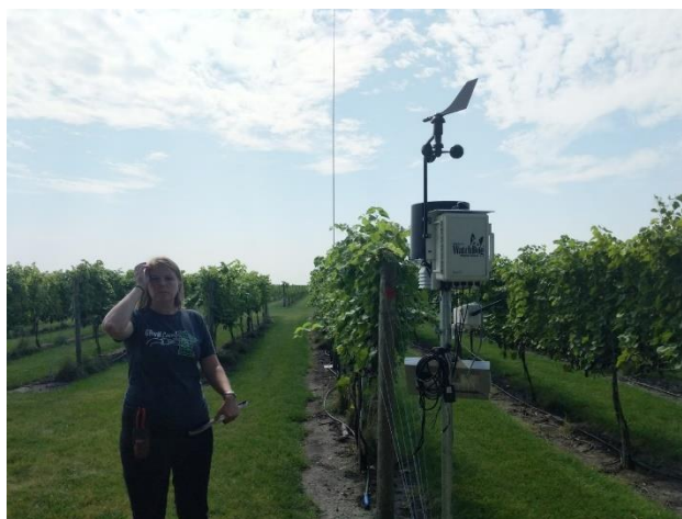
A wireless distress call speaker in a vineyard, mounted to a weather station.

Many berry growers play artificial bird distress calls and predator calls from automated loudspeakers to repel birds from the field. The sounds confuse the birds into thinking that danger is near.