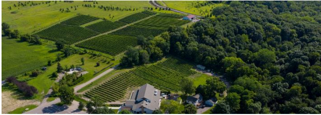
The surrounding habitat (e.g. forest, plains, lakes) influences bird pressure on a fruit crop.

Weather and year: A dry year will likely bring more birds to the vineyard because native sources of food are harder to find. Dry years may also mean lower yields for non-irrigated crops, making it even more important to protect the small crop from birds. In Minnesota, many baby birds begin flying and foraging for food starting in July and August, right as grapes and fall-bearing raspberries are ripening.