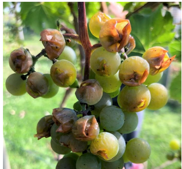
Photo: Birds have pecked these grapes, leaving damage that lets in bunch rot diseases.

Bird pressure depends on several factors including: Surrounding habitat, weather, year, grape variety, bird species, migratory patterns, and time of day.