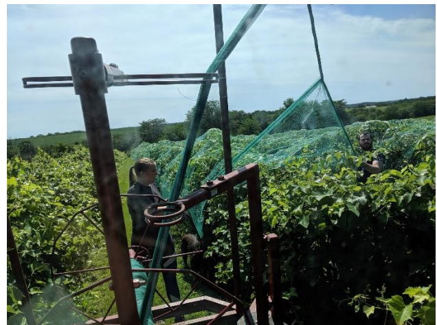
Photo: Using a Netter Getter to apply woven bird netting to a vineyard.

Netting is still the most effective and reliable method of preventing bird damage in vineyards and berries, because it is a physical barrier. It is almost 100% effective when used properly. Bird netting is applied shortly before ripening and remains in place until harvest. In vineyards, it is applied after veraison over individual rows of grapevines. Over-row netting is applied and removed with a net applicator implement (for example, Netter Getter).